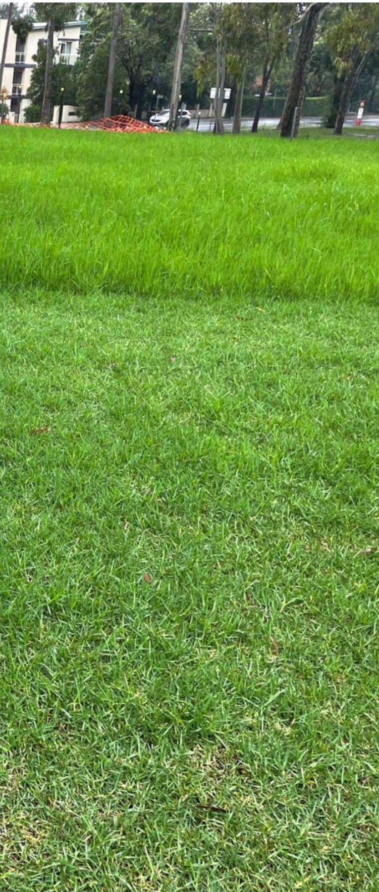
Untreated (top) vs Untreated (bottom) Kikuyu Grass

While auxins and cytokinins are hormones we are keen to encourage and we like to support the plant by adding more, gibberellic acid (jib-er-relic) is one we aren't so keen to promote.