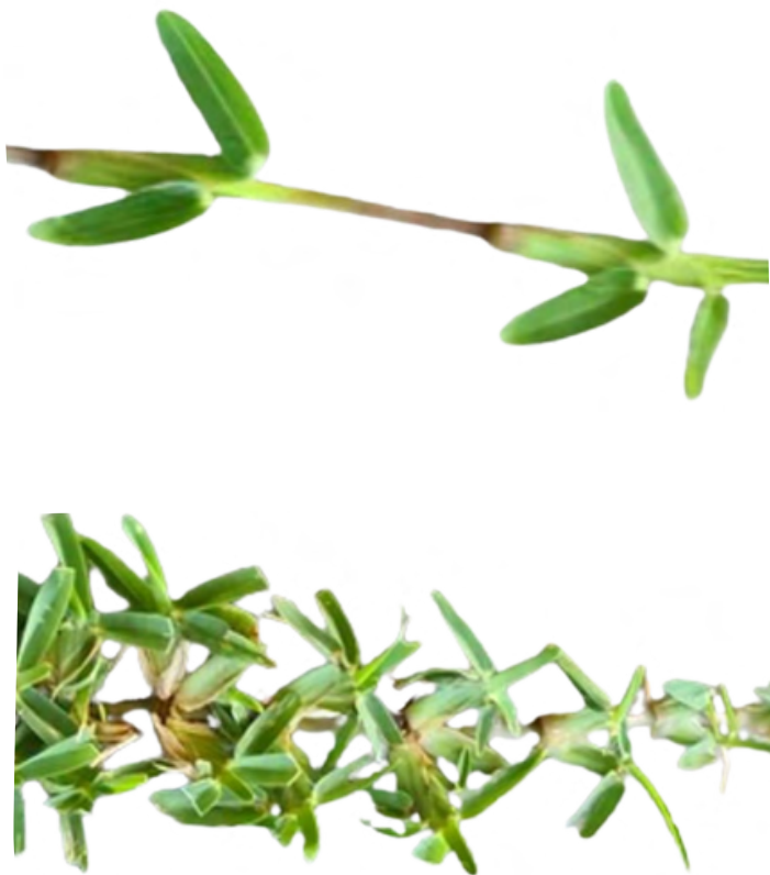
Treated (top) vs Untreated (bottom) Buffalo Grass

For many the concept of regulating the way your grass grows may be a new concept, so we are going to start with the basics.